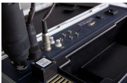
The GreenLine 8000 uses a wireless communication between MCU and RCU